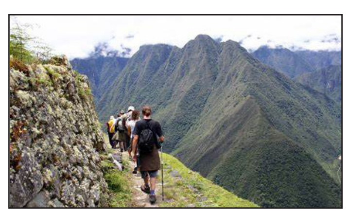
Inca Trail - Cusco 4 days/3 nights (can be longer)