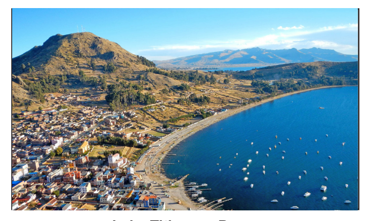
Lake Titicaca - Puno 3 days/2 nights