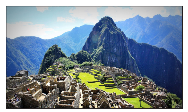
Machu Picchu - Cusco 4 days/3 nights