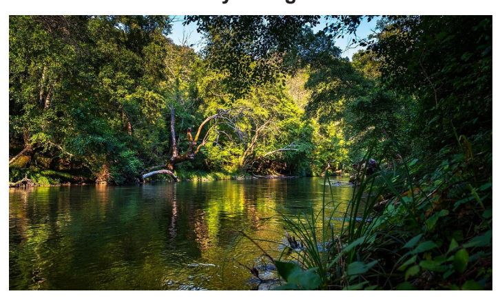
Amazon Rain Forest - Iquitos 4 days/3 nights