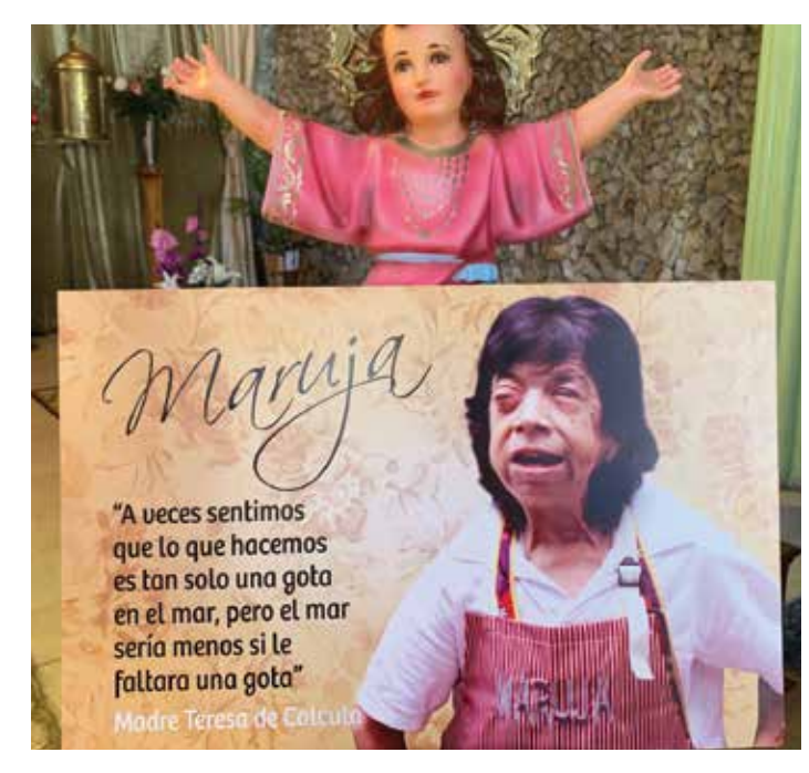
"Sometimes we feel that what we do is just a drop in the sea, but the sea would be less if it lacked a drop."