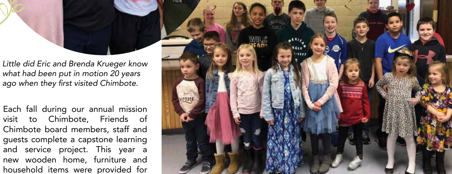
Faith formation class of St. Joseph's Church in Brooks, MN raises more than $4000 to benefit a family thousands of miles away in Chimbote, Peru.

visit to Chimbote, Friends of Chimbote board members, staff and guests complete a capstone learning and service project. This year a new wooden home, furniture and household items were provided for a family in deep poverty. The three generation family of six earn three dollars per day. They live with serious physical and mental health challenges in the neighborhood of Jesus of Nazareth in Chimbote.